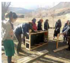
Solar dryers made by mountain women

Mountain governments, institutions and NGOs explored issues in Bonn, Germany related to climate change adaptation and management as well as sharing experiences