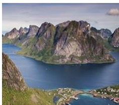
Mountains and islands - COP23

Organized within the framework of the Mountain Partnership, the official side event "Implementing the 2030 Agenda & Paris Agreement in mountains: building a Framework for Action" was held on