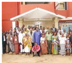
West African Mountain Forum held in Togo

The first West African Mountain Forum was held in Kpalime, Togo on 5–8 October 2017. Although West African mountains are not the world's highest, they have a key role for the food security of the area,