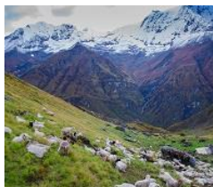
Building a framework for action - COP23

The first West African Mountain Forum was held in Kpalime, Togo on 5–8 October 2017. Although West African mountains are not the world's highest, they have a key role for the food security of the area,